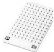
Marker card, Card, white, labeled, Horizontal: Consecutive numbers 1 - 10, 11 - 20, etc. up to 91 - (99)100, Mounting type: Adhesive, for terminal block width: 5 mm, Lettering field: 5 x 3.8 mm

Marker card - SK 5/3,8:FORTL.ZAHLEN - 0804183